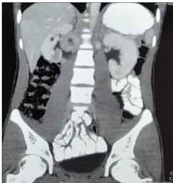
Figure 1: CECT abdomen showing heterogeneously enhancing lesion in right paravertebral region in retrocaval location

to pre & right paravertebral region with no bony erosions.