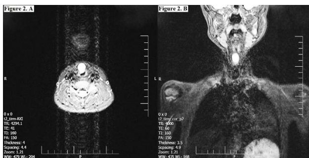
Figure 2: T2-weighted MRI findings. The congenital laryngeal cyst is seen as a hyperintense lesion in the axial section (A) and coronal view (B).