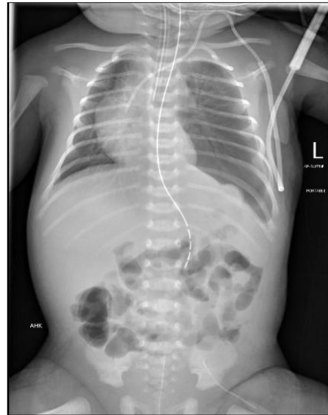
Figure 3: Chest x-ray 5 days after surgery.

follow up after six weeks' patient is asymptomatic with no residual chest deformity. Newborn genetic screening result are normal.