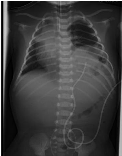
Figure 1: Chest x-ray before surgery

defect was anterolateral containing a thick sac comprising almost 30% of the entire left diaphragm (Figure 2).