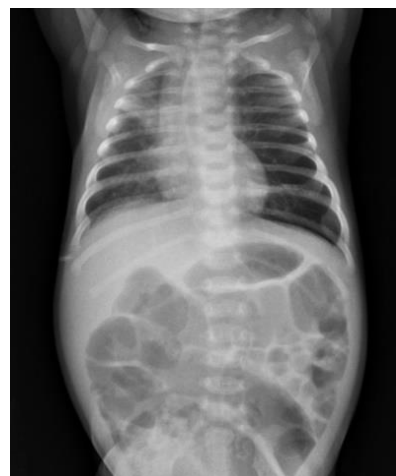
Figure 1: The x-ray showing Congenital lobar emphysema LUL

found to have an opacity in left lower chest on x-ray. CT revealed Congenital extralobar pulmonary sequestration, in left hemithorax. She underwent resection. Sequestration had separate blood supply from aorta. She made an uneventful recovery. Figure 3.