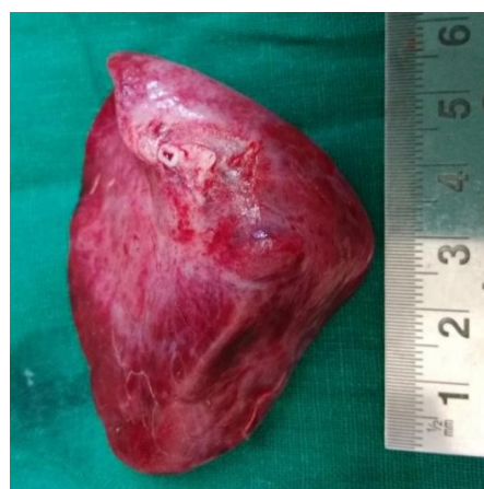
Figure 3: Gross pathological image showing Extralobar sequestration Left hemithorax is shown