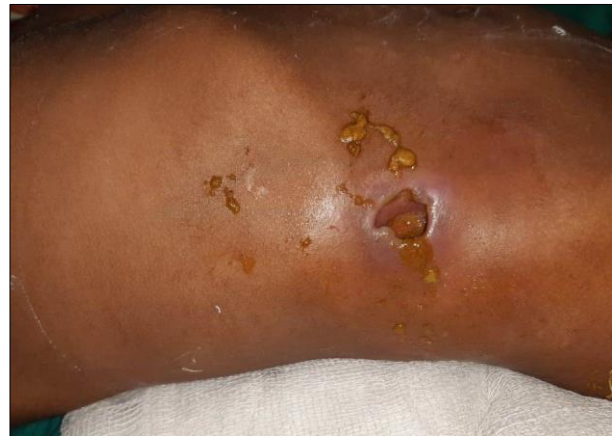
Figure 1: Fecal Discharge from Abdominal wall Abscess

seven. On serial Follow-up's patient developed no complications.